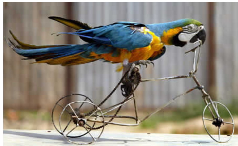
Drive-by parrot trolling - a new epidemic sweeping the nation's pet owners.

My hand went to my volleyball to smash that fishbowl, parrot and all. It knocked over the crate, he flew free, and thus ensued a bitter war. I lunged for his head, craving a fight, but he went and plowed through the light, Zipped out the window, and into the night, my parting shot, a fearsome roar. And so I went back and studied Fourier, Newton, Maxwell, and Bohr But quoth the parrot "Nevermore."